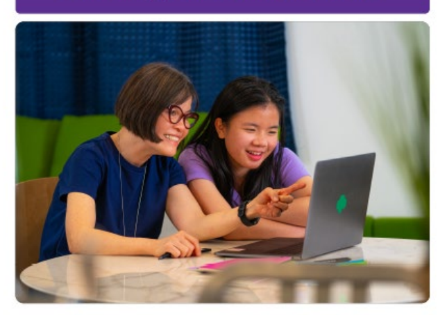
girl scouts heart of new jersey